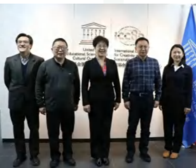
In December 2023, Yang Xinyu, Chinese ambassador to UNESCO, makes an inspection visit to ICCSD.