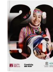
"Creativity 2030" I Sustainable Development Goal 8: "Decent Work and Economic Growth" (2020)