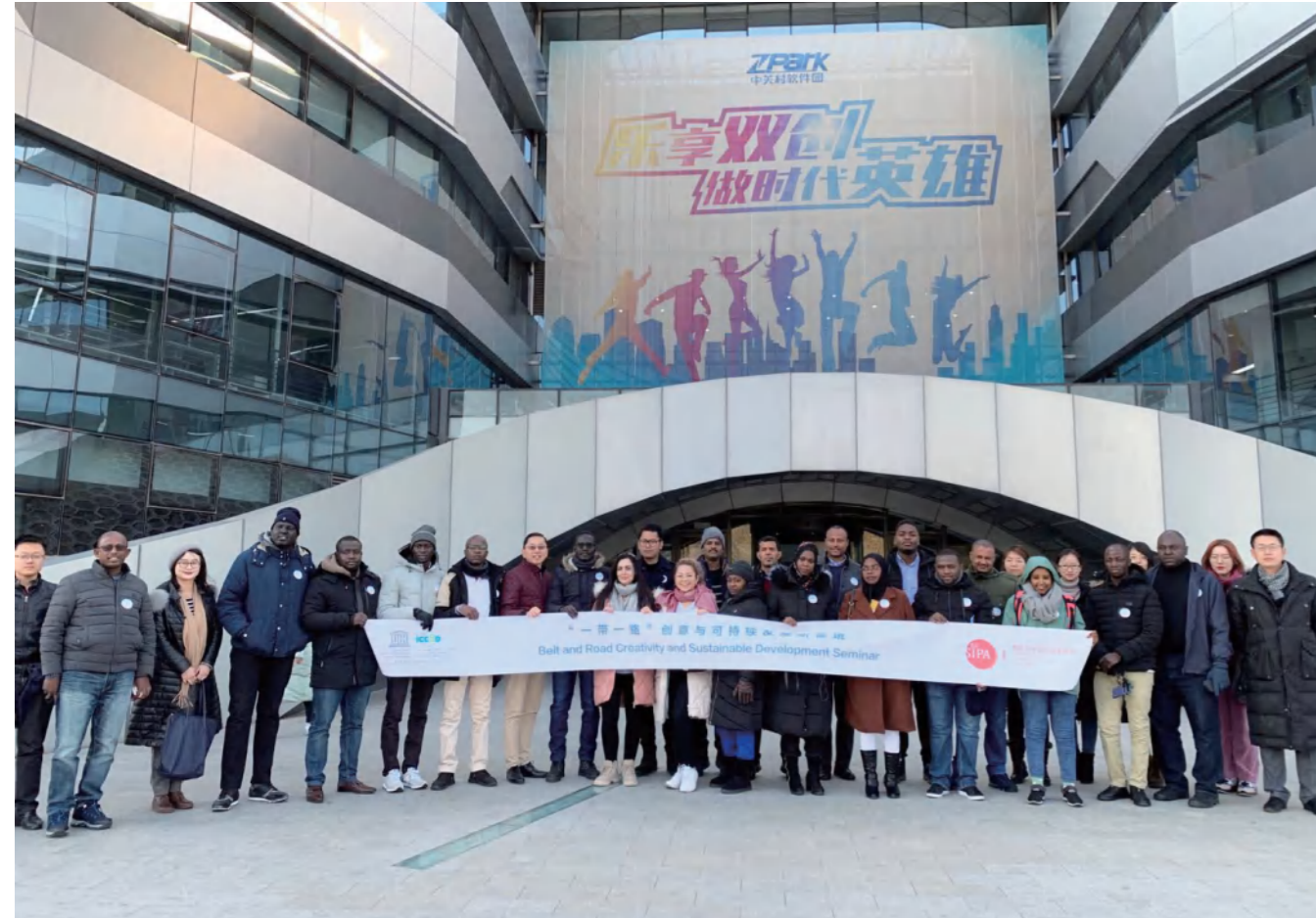
In December 2019, "the Belt and Road" Creative and Sustainable Development Training Course convenes, drawing over 20 participants from Asia and Africa.