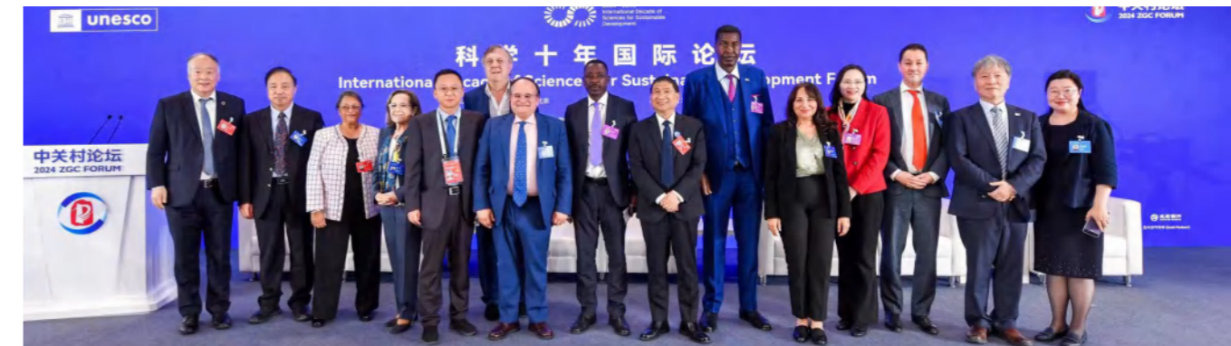
Guest group photo

In response to the United Nations' Resolution on the International Decade of Sciences for Sustainable Development 2024-2033 (hereinafter referred to as "the International Decade of Sciences"), ICCSD executes and coordinates the International Decade of Sciences for Sustainable Development Forum.