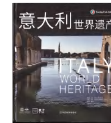
ICCSD collaborates with Cesena Media and Touring Club Italiano to release "Italian World Heritage".