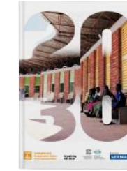
"Creativity 2030" I Sustainable Development Goal 4: "Quality Education" (2019)