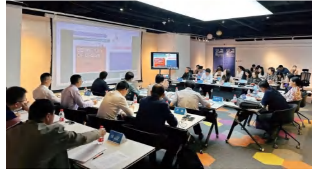
In May 2023, the 2023 UNESCO Creative Cities Network Application Q&A session convenes in Beijing. The session assisted cities across China in joining the Creative Cities Network (UCCN).

ICCSD conducts capacity-building activities through its online and offline education and training systems. It provides educational and creative skills training for youth, women, and businesses from developing countries, sharing practical models and development experiences.