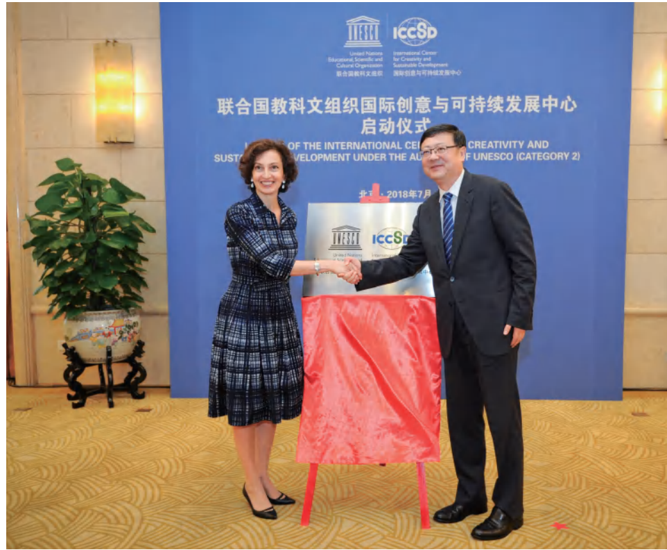
In July 2018, Mr. Chen Jining, then-Mayor of Beijing, and Madame Audrey Azoulay, UNESCO Director-General jointly unveils ICCSD's plaque.

As the world's first UNESCO Category 2 centre dedicated to "Creativity and Sustainable Development", ICCSD aims, with UNESCO's support, to engage in both domestic and international endeavors such as research, training, exchanges and collaboration. It seeks to attract global scientific and technological talents and their innovative teams, thereby nurturing a globally influential hub for creative and innovative thinking. Moreover, it strives to act as a catalyst for cross-cultural exchange and cooperation, while also facilitating the global reach of Chinese enterprises, technologies and culture.