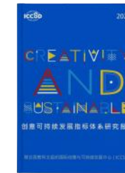
The ICCSD's release of a bilingual "Report on Creativity and Sustainable Indicators" (2021)