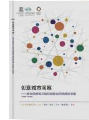
The ICCSD's release of a bilingual of "Observatory on Creative Cities: The Development of the UNESCO Creative Cities Network (2004-2019)" (2019)