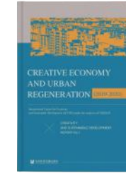
The ICCSD's publication of a bilingual "Creative Economy and Urban Regeneration" (2020)