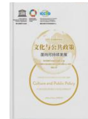
The ICCSD's launch in collaboration with UNESCO of the Chinese version of "Culture and Public Policy for Sustainable Development" (2021)