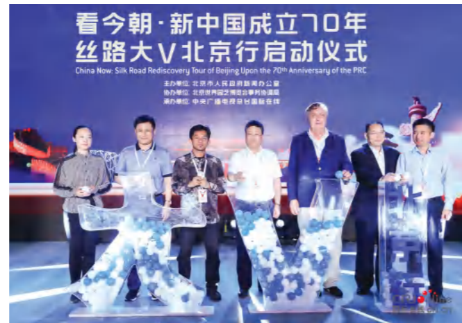
In August 2019, the Chairman of ICCSD's Advisory Committee participates in the "Silk Road Rediscovery Tour of Beijing" event hosted by Information Office of the People's Government of Beijing Municipality.